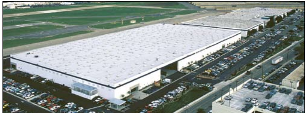
Robinson's 480,000 square foot facility.

To maximize efficiency, a large percentage of parts are made in-house. This allows Robinson to maintain a higher level of quality control, monitor production schedules and eliminate unnecessary costs.