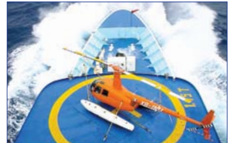
R44 Clipper I shown shipboard with optional rotor blade supports and frame tie-down lugs.