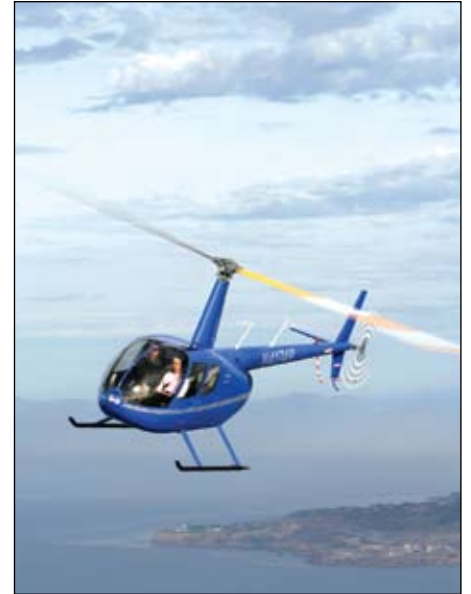
R44 Raven II delivers increased altitude performance.