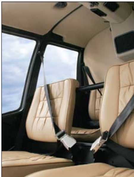
R44 Raven II Interior shown with optional leather seats and air conditioning.