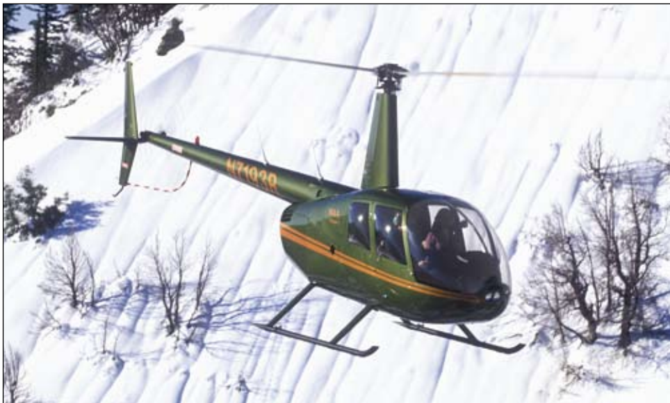
The price-performance ratio makes the R44 Raven I an excellent flight trainer.

Equipped with a Lycoming O-540 carbureted engine, the R44 Raven I offers a balance between performance and affordability. Raven I features carburetor heat assist that enhances safety and reduces pilot workload by automatically adjusting carburetor heat in response to power changes by the pilot.