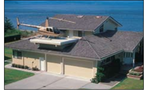
R44 Clipper II, with pop-out floats stowed, on a residential rooftop helipad.

Available only on the Clipper II, pop-out floats have the same buoyancy as fixed-utility floats. The compact, low profile design minimizes the floats' impact on the helicopter's cruise speed and makes it easy to get in and out of the helicopter. Pop-out floats add 65 pounds to the helicopter's empty weight and when not inflated stow in snug sleeves along the skid tubes. A trigger on the collective deploys the floats, which inflate from a compressed helium-filled, carbon-fiber tank located under the left front seat.