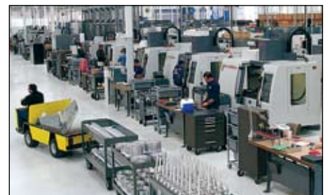
CNC machining centers